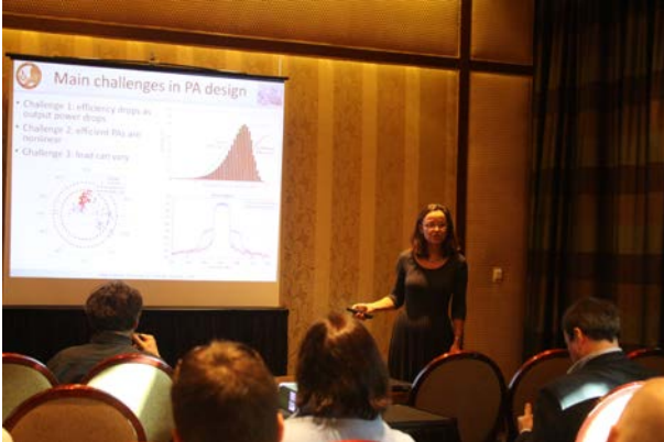
Two workshops covering extensive overviews on emerging topics are organised at the Fall Symposium.