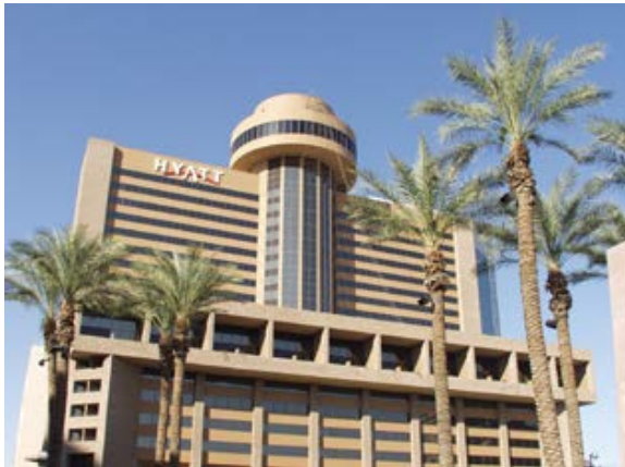
The Hyatt Regency Hotel, site for the 85 th ARFTG Microwave Measurement Conference.