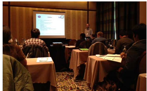
The Short Course introduces attendees to a wide range of microwave measurements topics.

3 rd . About 30 people attended this course with topics covering everything from power, S-parameter, noise, oscilloscope, and spectral measurements to mm-wave and on-wafer techniques, nonlinear characterization, and load pull. Many thanks are due to the twelve instructors who made this short course successful.