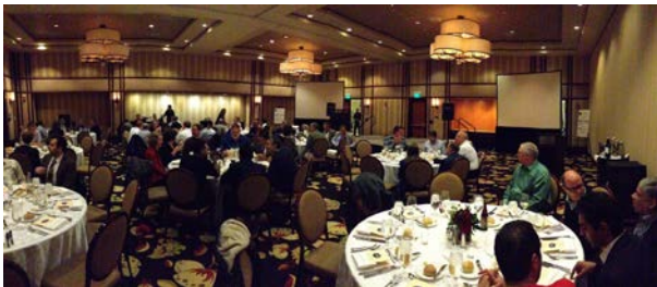
ARFTG Awards Banquet: place for social interactions.