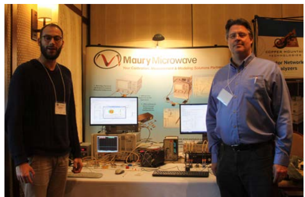
Extended breaks allowed for ample interaction between attendees and exhibitors.

To exhibit at future conferences, please contact the Exhibits Chair, Joe Gering, at exhibits@arftg.org .