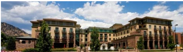
St. Julien Hotel, site for the Fall 2014 ARFTG Symposium

The Fall 2014 ARFTG Microwave Measurement Symposium took place at the St. Julien Hotel in Boulder, CO. The event was held over four days from Tuesday, December 2 nd to Friday, December 5 th . The Symposium consisted of a 1 ½ day short course on microwave measurements, two workshops, an NVNA users' forum meeting, and the main conference. The theme of this year's symposium was "The New Frontiers for Microwave Measurements". The symposium 'main event' was the 84 th ARFTG Microwave Measurement Conference, which took place on Thursday and Friday. In addition to these technical events, there was an awards banquet on Thursday evening and a vendor exhibition during the main conference. Taken together, this amounted to four days packed with exciting activities for RF, microwave, and millimeter-wave engineers and technologists.