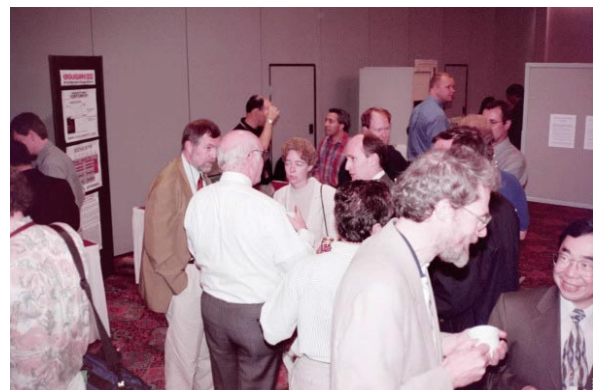
Informal discussions amongst the conference attendees about measurement needs, problems and solutions is an important part of every ARFTG meeting