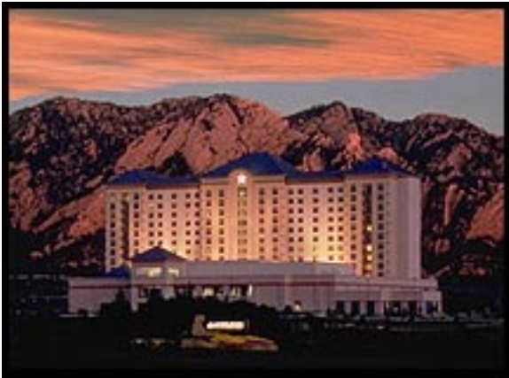
The Omni Hotel and Resort located just outside Boulder