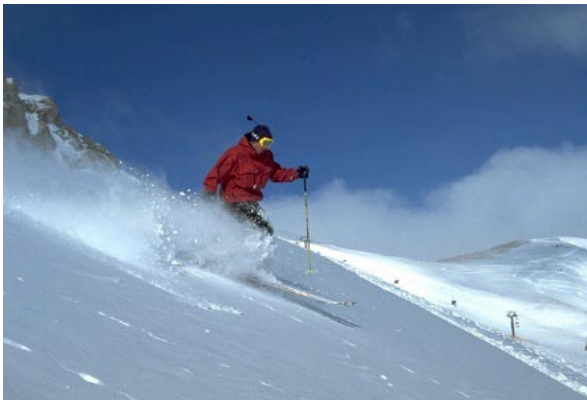
Skining in Loveland