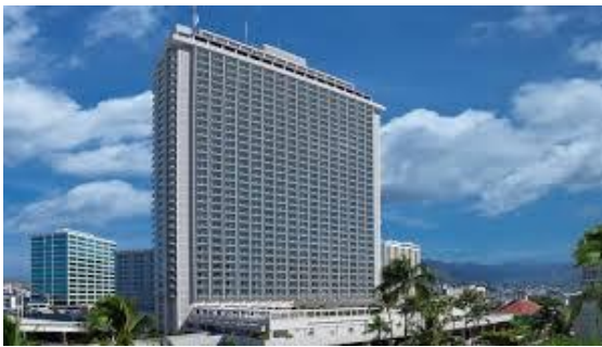
Ala Moana Hotel, Honolulu, Hawaii, location of the Summer 2017 ARFTG Symposium

The Summer 2017 ARFTG Microwave Measurement Symposium took place at the beautiful Ala Moana Hotel, Honolulu Hawaii. The event was as part of Microwave Week along with the International Microwave Symposium. The symposium was held on Friday June 9 th and there were two co-sponsored workshops and technical sessions with the International Microwave Symposium (IMS2017) on Monday June 5 th and Thursday June 8 th . In addition, the symposium also hosted the NVNA user's forum and the on-wafer users' forums.