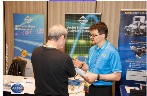
ARFTG allows for extensive interaction between attendees and exhibitors. (photo by LylePhotos).

To exhibit at a future conference, please contact the Exhibits Chair, at exhibits@arftg.org .