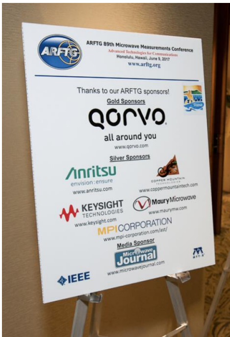
Thanks to the ARFTG sponsors!

For future sponsorship opportunities, contact the Sponsorship Chair, at sponsorship@arftg.org .