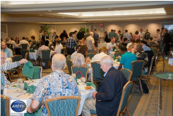
ARFTG Awards Banquet: place for social interactions.