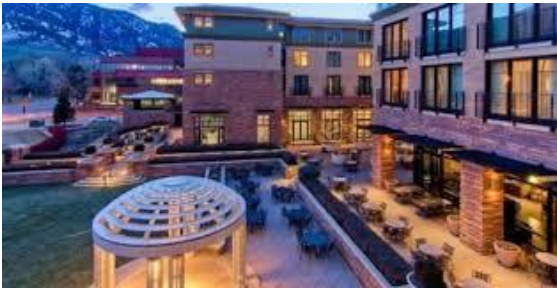
St. Julien Hotel and Spa, Boulder Colorado, location of the Fall 2017 ARFTG Symposium

The Fall 2017 ARFTG Microwave Measurement Symposium took place at the lovely St Julien Hotel and Spa in Boulder Colorado. The symposium was held from Tuesday Nov 28 th through Friday December 1 st , 2017