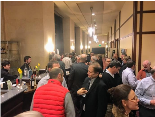
ARFTG Reception and Dinner: a great opportunity to for social interactions.