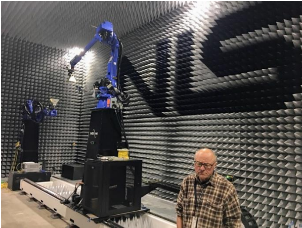
NIST hosted facilities tours for all interested ARFTG symposium attendees. Pictured above is a new robotic antenna system for very precise mm-wave measurements.