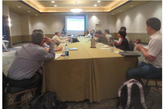
NVNA users' forum attendees listening to a research update.