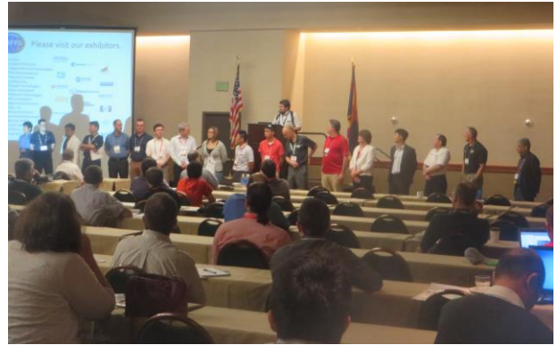
The Exhibits Chair introduces the exhibitors at the start of the morning break.

ARFTG has a strong tradition of holding an exhibition jointly with the conference. A total of 18 companies chose to exhibit their latest equipment at the 2015 Spring ARFTG conference.