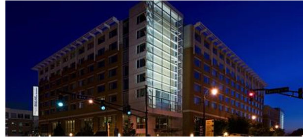
Georgia Tech Hotel and Conference Center is the site of the 86 th Fall ARFTG Symposium.