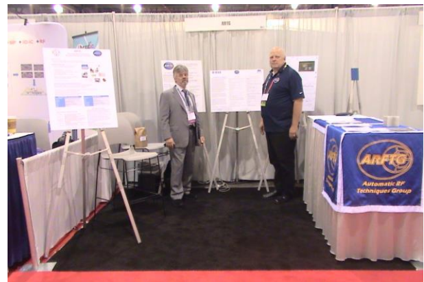
ARFTG booth at the IMS exhibition.

In addition to its conference, ARFTG also sponsored a meeting of the NVNA Users' Forum and Special Interest Group (SIG) on “Standards for Nonlinear Measurements,” next to two joint ARFTG/IMS Workshops. ARFTG was also represented by a booth at the IMS exhibition. All these activities ran from Monday, May 18 th through Friday, May 22 nd .