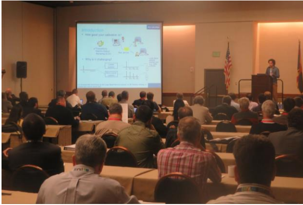
Attendees listened to a variety of measurement talks.