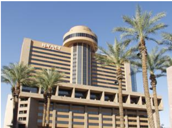
The Hyatt Regency Hotel, Phoenix, AZ, site of the 85 th ARFTG Microwave Measurement Conference.

The 85 th ARFTG Conference took place at the Hyatt Regency Hotel, Phoenix, AZ, on May 22 nd , 2015. The number of attendees was 170. The conference formed part of Microwave Week 2015, which also included the International Microwave Symposium (IMS), the Radio Frequency Integrated Circuits (RFIC) Symposium, and many workshops, short courses, and other meetings.